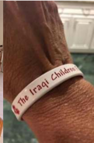
TEEBA: ICF AWARENESS-RAISING WRISTBANDS